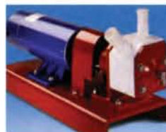
Variable speed drive