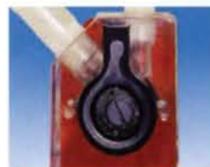
Rotor on eccentric shaft